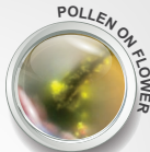
POLLEN ON FLOWER

Our 100x smartphone microscope is compatible with most phones and tablets. Experiment with the microscope and have fun observing different objects.