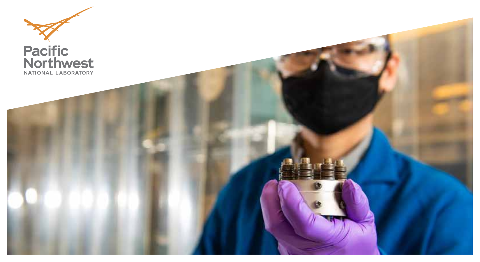
The Temperature-based Hibernating Battery provides long-term electricity storage without loss of electricity for several months.