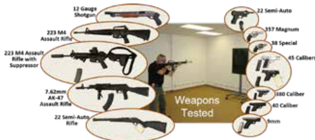
Police departments have tested the Acoustic Gunshot Detection technology with multiple calibers of weapons.

Engineered specifically with public schools in mind, the technology is easily integrated into larger security systems with hardware that performs accurate threat and firearm classification at a fraction of the battery capacity, computational power, and cost of today’s smartphones.