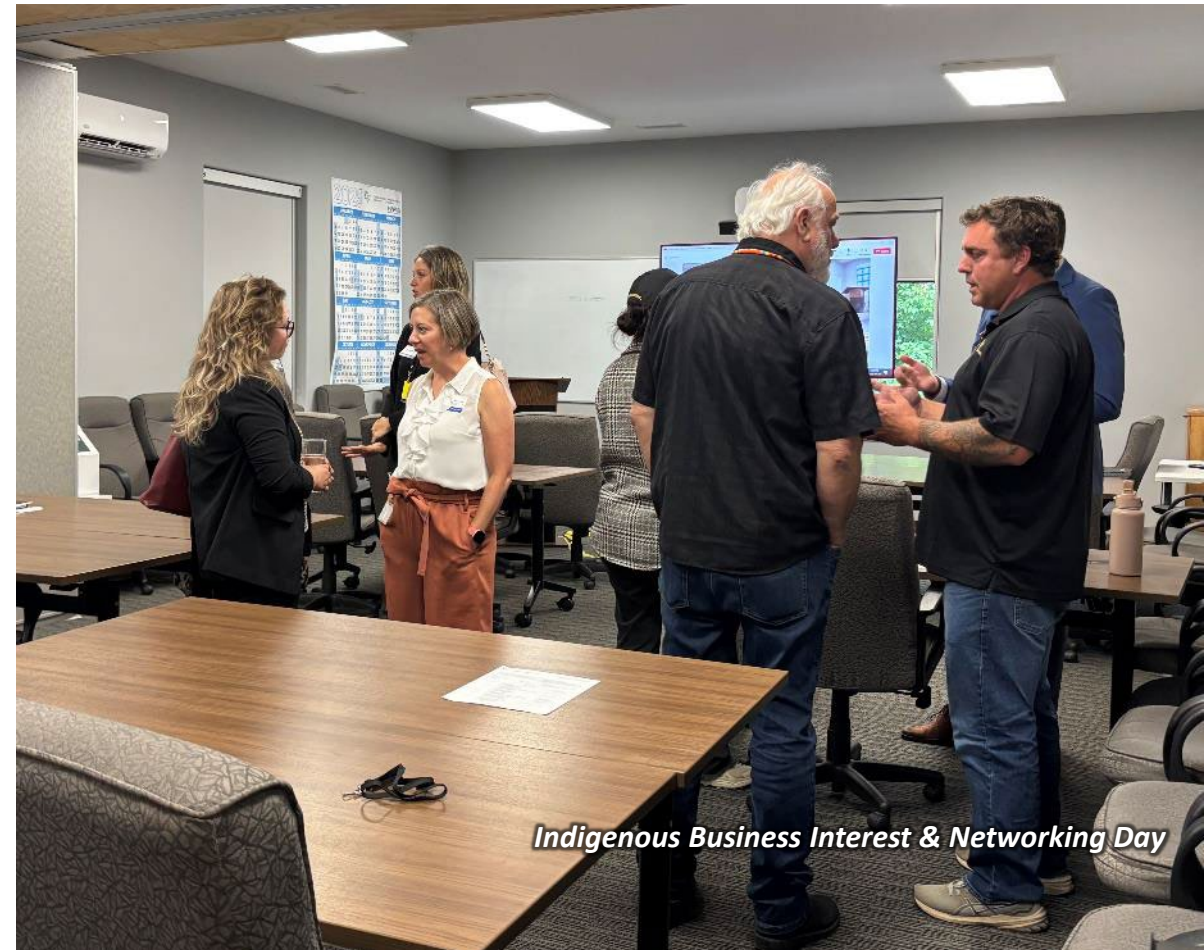
Indigenous Business Interest & Networking Day

Work together to benefit future generations