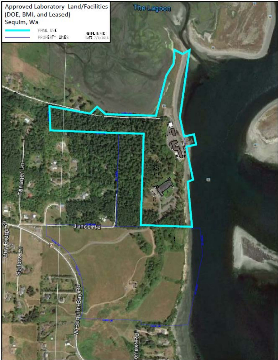
Sequim Map (Figure JH-1A)