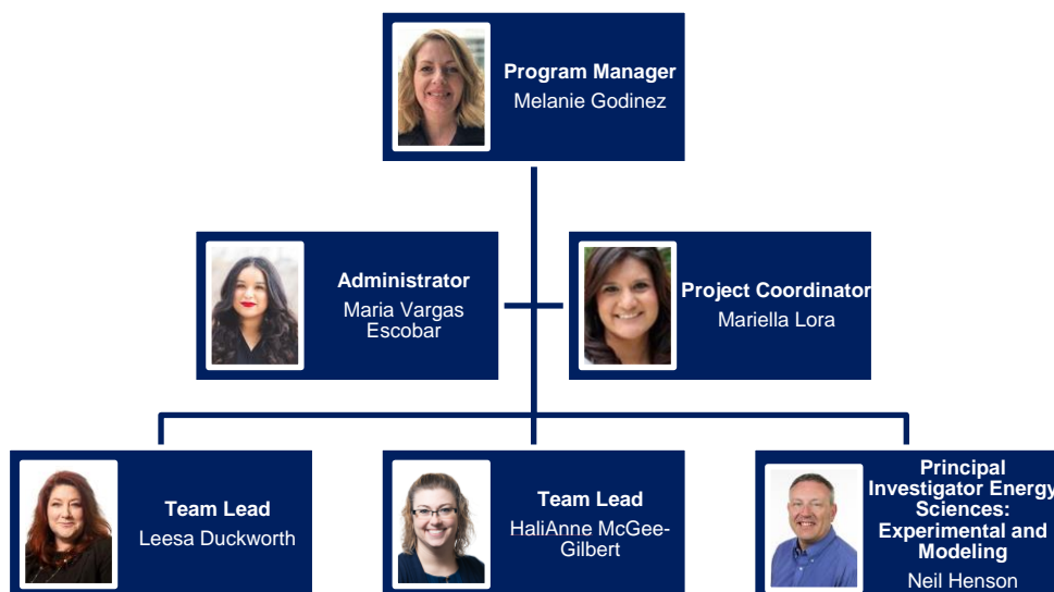
Figure 1. MSIPP-NNSA Team

The MSIPP-NNSA program at PNNL is administered by the National Security Professional Leadership Group (NSLP) in PNNL's National Security Directorate. This organization has nearly two decades of experience administering the NNSA Graduate Fellowship Program (NGFP). As a result, PNNL brings to MSIPP-NNSA a reliable and replicable next-generation leadership development program management approach. This includes unmatched experience welcoming aboard early-career, limited-term employees and navigating the nuances of onboarding within the national security mission space. The MSIPP-NNSA leadership team is outlined in Figure 1 and supported by mentors and support staff from across PNNL.