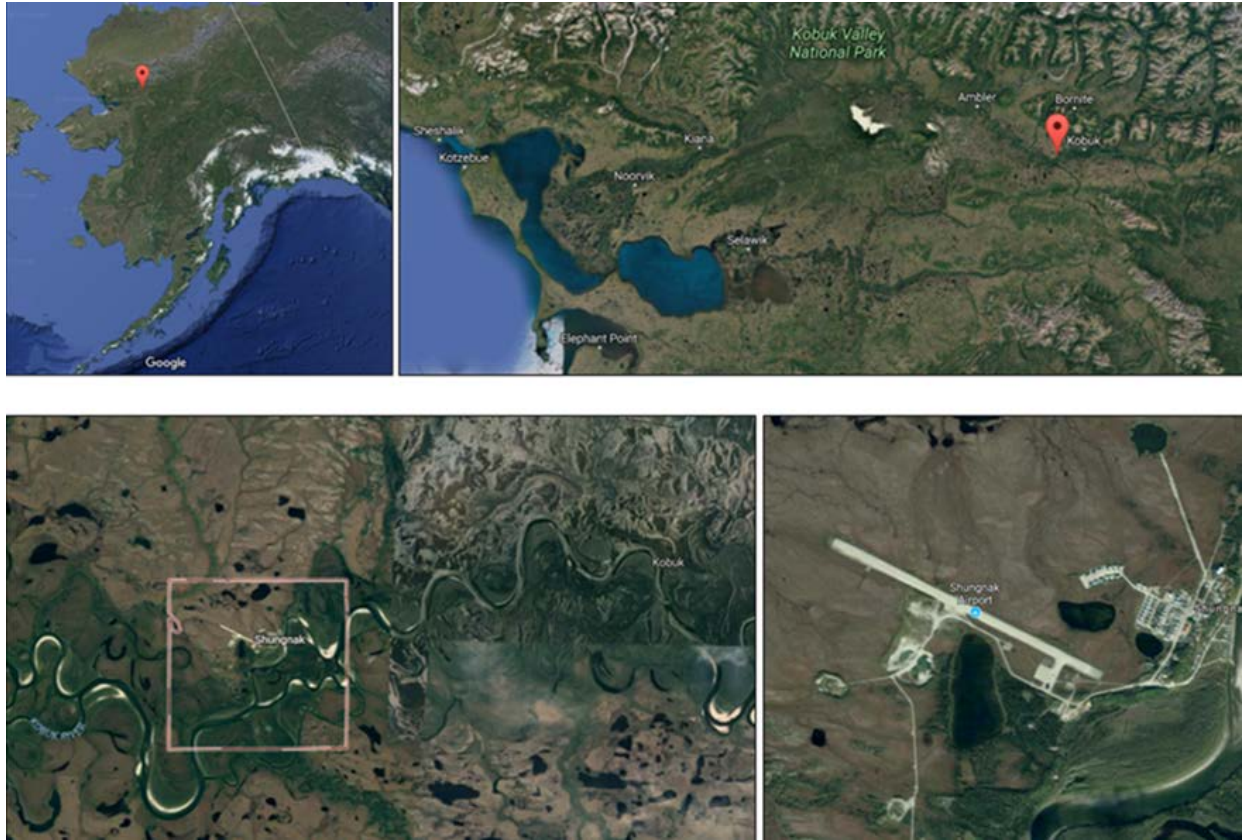
Figure 2-1: Regional map of Shungnak. Shungnak location in Alaska (upper left), location in Northwest Arctic Borough (top right), location on the Kobuk River (bottom left), and view of Shungnak Village (bottom right) Source: Google Maps

See Table 2-1 for diesel prices from FY2012-FY2016. The table also indicates the cost of electricity sold over the same period. In addition, note the high line losses shown from 2013 and 2016 at over 40%. Powerhouse consumption is about 2.8% of production.