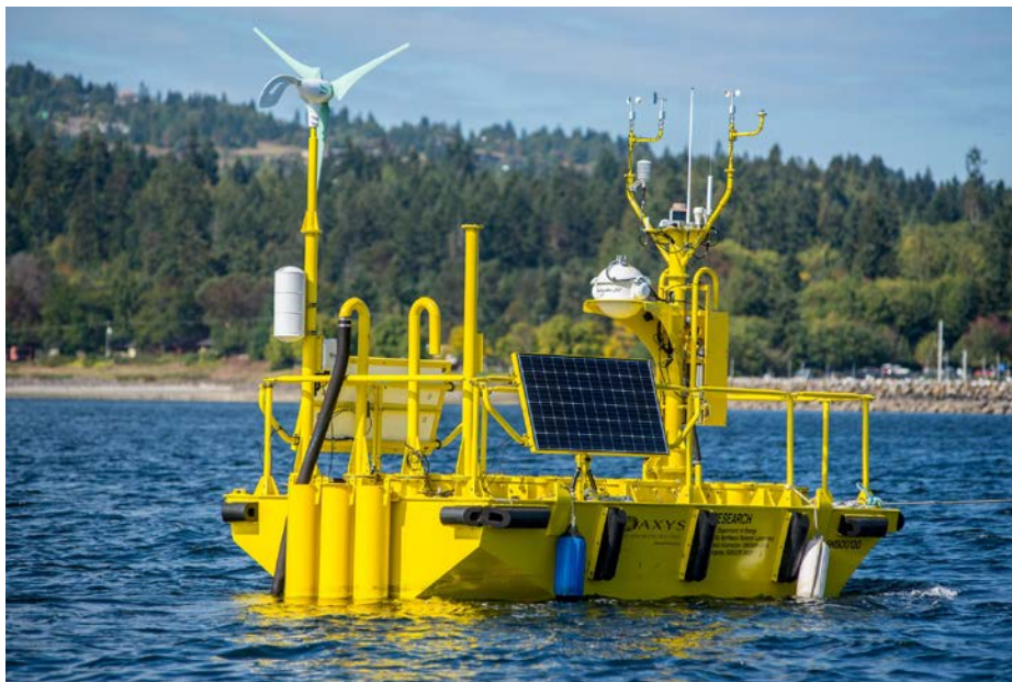
Figure 1.1. One of Two DOE WindSentinel Buoys

Figure 1.1 is a photo of one of the buoys shortly after its delivery to PNNL. The centerpiece of the instrumentation suite for each buoy is a motion-corrected lidar system that can provide profiles of the wind speed and direction from the surface to 200 m. In addition to a lidar, each buoy collects ocean temperature, salinity, current, and wave data as well as near-surface air temperature, humidity, and wind speed and direction. The buoys have been deployed at DOE's direction, for a year, in different regions of the U.S. to collect hub-height offshore wind data in support of the U.S. offshore wind industry. The data produced by the buoys represent the first publicly available multi-seasonal hub-height data to be collected in U.S. coastal waters. The buoys consequently provide an important new opportunity to characterize the wind resource using observations in regions targeted for wind development.