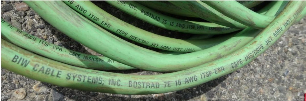
Figure 2. BIW (EPR/CSPE) (FWA75) Cable from CR3