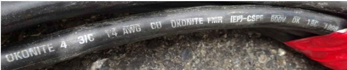
Figure 5. Okonite (EP-FMR/CSPE) (EFC51) Cable from CR3

The 68 foot long, black-jacketed Okonite Power & Control cable provided (CR3 ID EFC51), seen in Figure 5, is composed of three 14 AWG. The jacket is labeled “OKONITE 4 3/C 14 AWG CU OKONITE FMR (EP)-CSPE 600V 18C 1998”. Jacket material is 45 mil Okolon CSPE and insulation is 40 mil Okonite FMR EPR. The cable was manufactured in February of 1998, installed in CR3 in September of 1999, and saw 15 years of service in the Emergency Feedwater system with operational current 0.1 A, operational voltage of 120 VAC, and 100% duty factor. It was designated as Safety Related, and was under Maintenance Rule. Okonite EPR is the fourth most common insulation in containment, found in 25% of plants.