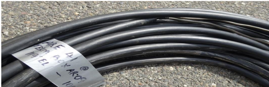
Figure 4. Kerite (HTK/FR) (ARE41) Cable from CR3

insulation in containment, found in one-fifth of US plants. The ARE41 Kerite cable has an asbestos filler between the insulated conductors and the jacket. The asbestos filler will be removed (abated) from the cable and the insulation and jacket components tested and certified to be asbestos-free prior to dissection.