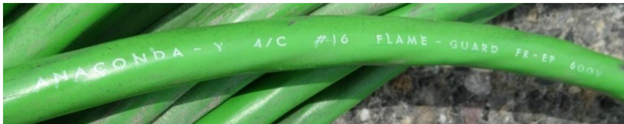
Figure 1. Anaconda (FR-EP/CPE) (RCR296) Cable from CR3

The 24 foot long, green-jacketed Anaconda 600V Instrument cable provided (CR3 ID RCR296), seen in Figure 1, is of shielded twisted quad (STQ) (four conductor) construction. Each conductor is 16 American wire gauge (AWG) and the copper drain wire is 18 AWG. The jacket is labeled “ANACONDA-Y 4/C #16 FLAME-GUARD FR-EP 600V”. Jacket material is 55 mil CPE and insulation is 26 mil EPR. The cable was manufactured in February of 1985, installed in CR3 in April of 1985, and saw 30 years of service in the Reactor Coolant system with operational current less than 5 mA, operational voltage of 5 VDC, and 100% duty factor. It was designated as Safety Related and under Maintenance Rule. Anaconda EPR is the second most common insulation in containment, found in one-third of plants.