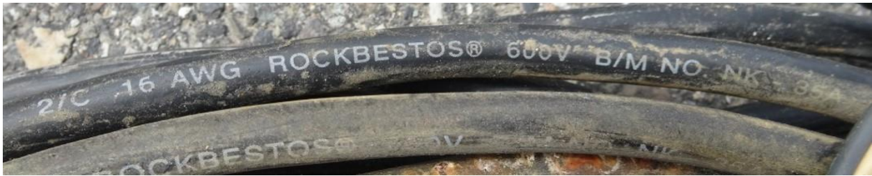
Figure 6. Rockbestos Firewall III (XLPE/CSPE) (CIS1) Cable from CR3