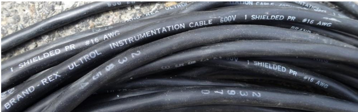
Figure 3. Brand Rex (FR-XLPE/CSPE) (RCR283) Cable from CR3

The two 24 foot long, black-jacketed BIW Control & Instrument Wiring cables provided (CR3 IDs RCR283, RCR284), seen in Figure 3, are of STP construction. Each conductor is 16 AWG. The jacket is labeled “BRAND-REX ULTROL INSTRUMENTATION CABLE 600V 1 SHIELDED PR #16 AWG”. Jacket material is 45 mil CSPE and insulation is 25 mil XLPE. The cable was manufactured in April of 1986, installed in CR3 in September of 1994, and saw 21 years of service in the Main Feedwater system with operational current 4-20 mA, operational voltage of 24 VDC, and 100% duty factor. It was not designated as Safety Related, but was under Maintenance Rule. Brand Rex XLPE is the third most common insulation in containment, found in 28% of plants.