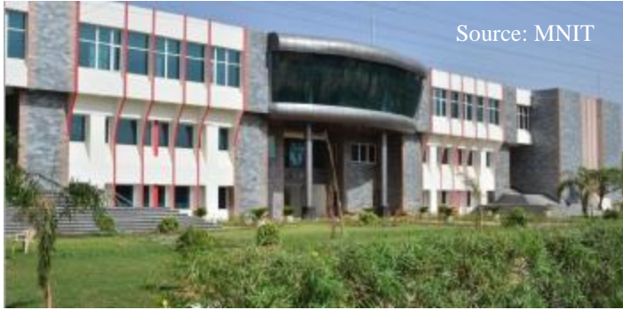
Figure 3 Prabha Bhawan

Prabha Bhawan complies with R-ECBD through the whole building simulation approach. The work in the building consists of retrofitting the existing ground floor and constructing two additional floors. The air-conditioned space of Prabha Bhawan increased from 4,000 m 2 to 11,300 m 2 . It can accommodate additional occupants and is able to hold more group activities like