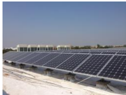
Figure 4 Rooftop Solar PV System

Prior to construction, it is critical for the investor to understand the economic feasibility and return before adopting energy efficiency measures. Therefore, MNIT conducted a payback analysis 8 to inform decision making. For example, the payback periods for wall and roof insulation were assessed over a range of insulation levels (for example 1-inch insulation would pay for itself in 3.2 years, when 2-inch insulation would take 9.2 years to pay for itself).