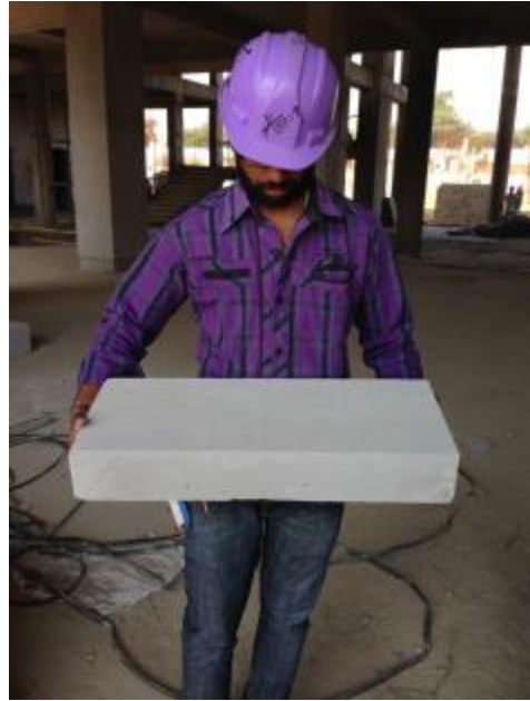
Figure 5 Concrete Used in Prabha Bhawan

As demonstrated by MNIT's own simulation of windows considered for installation, manufacturers may overstate the energy performance of materials and equipment. Other building projects have encountered similar problems with other energy efficiency materials and equipment. It is thus necessary to build a robust system to test, rate and label construction products (Evans, et al., 2014). In addition to improving code compliance, such a system could stimulate the advancement of energy efficiency technologies by providing clear market information on which materials perform best. In sum, testing, rating and labeling materials could help significantly improve building energy efficiency in India in the long term.