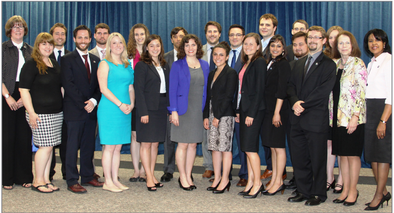
The Class of 2012, here with their leaders and mentors, gathers to celebrate their accomplishments at the end of their year.