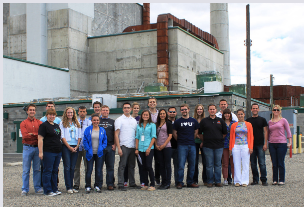
The Class of 2012 stands in front of the world's first operating reactor, at the Hanford Site in Washington state.

The mission of the Nonproliferation Graduate Fellowship Program (NGFP) is to produce exceptional leaders in nonproliferation and international security. In support of this mission, NGFP managed and completed activities for the Class of 2012. This included outreach to attract candidates, management of interviews, hiring, and providing career growth opportunities for the group throughout their year-long assignments from June 2012 through June 2013. Significant accomplishments included the following: