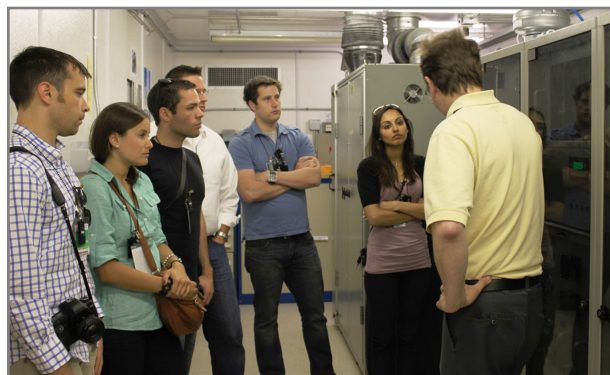
During their terms, participants got first-hand views of current technologies used in nonproliferation and counter-terrorism.