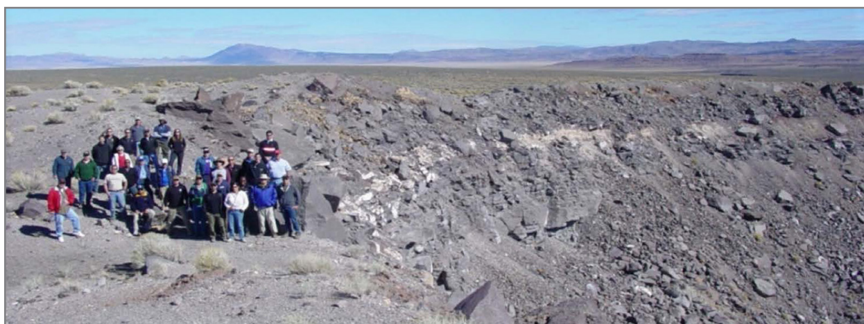
With colleagues from Los Alamos National Laboratory, a group of Fellows is dwarfed by a crater at the Nevada National Security Site.