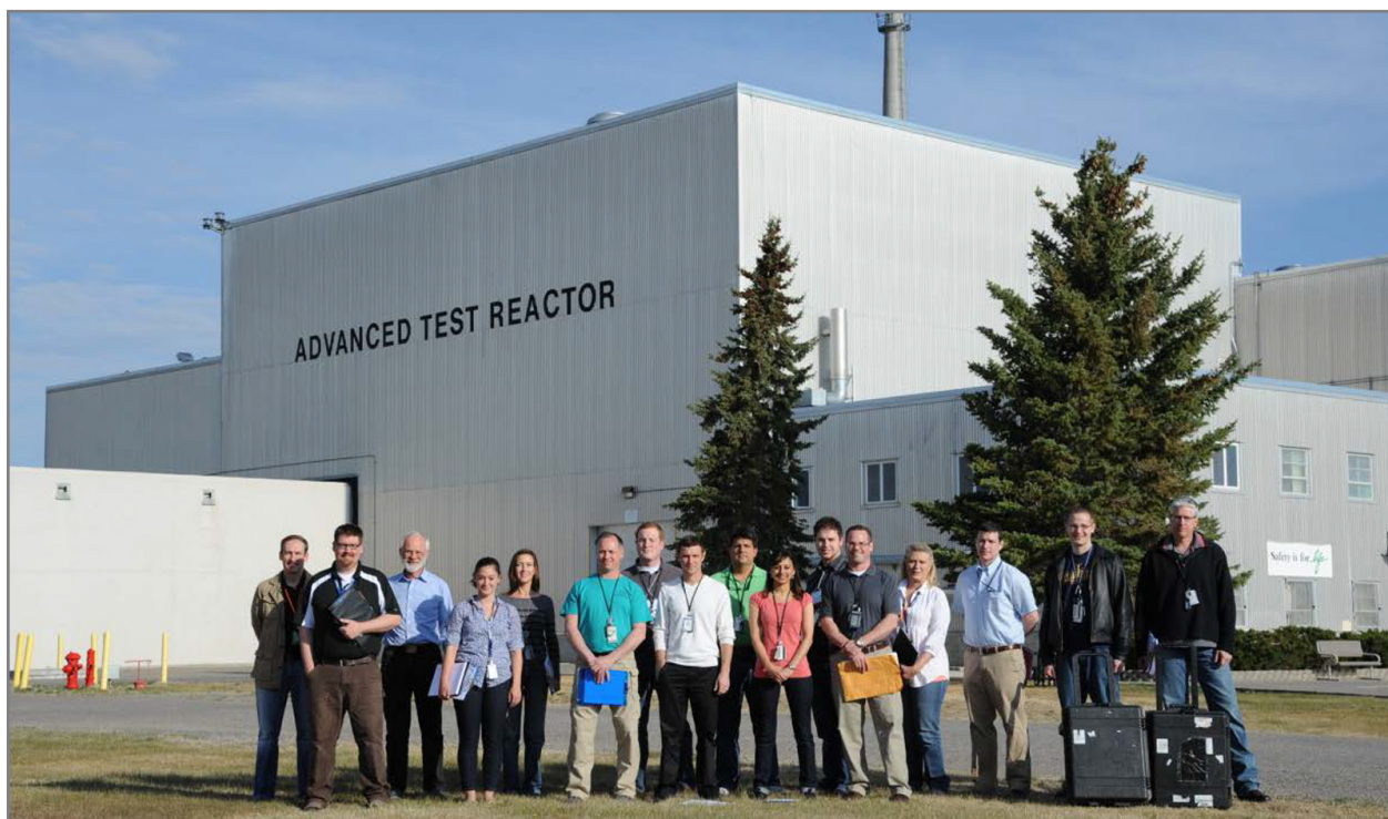
Fellows got a close look at the Advanced Test Reactor facility at the Idaho National Laboratory, where researchers study the effects of intense radiation on reactor materials and fuels.