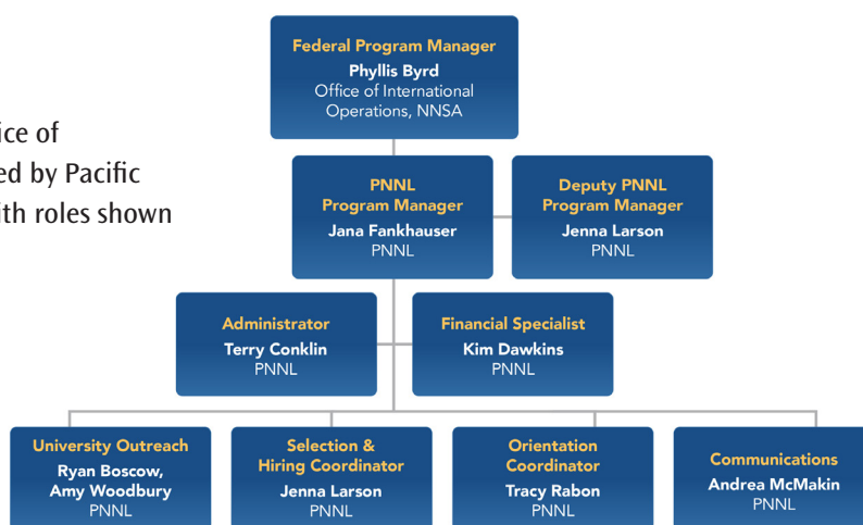
Organization for Class of 2012

The NGFP is managed through NNSA's Office of Management and Budget and administered by Pacific Northwest National Laboratory (PNNL), with roles shown in the chart to the right.