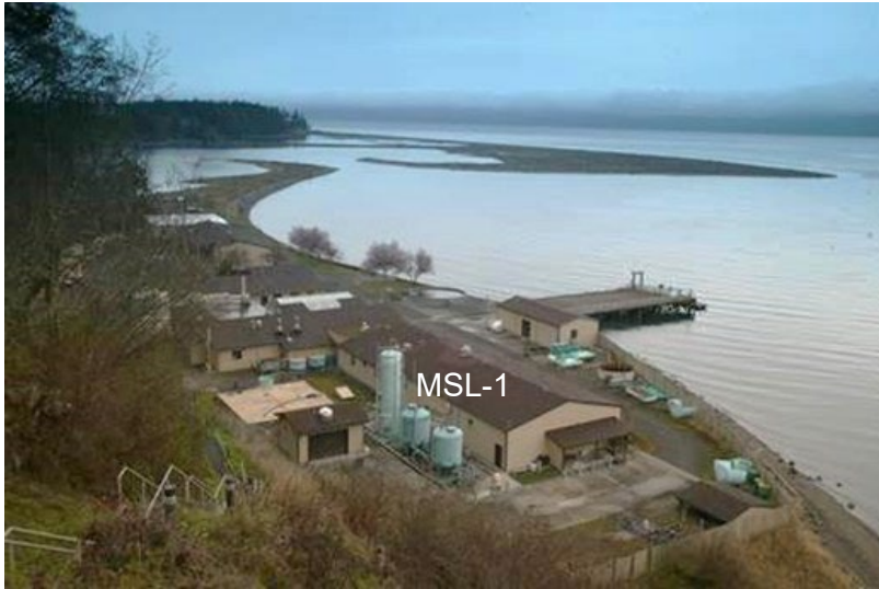
Figure 1.3. MSL-1 Building