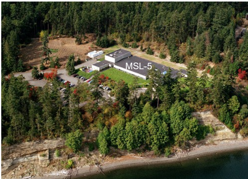
Figure 1.4. MSL-5 Building