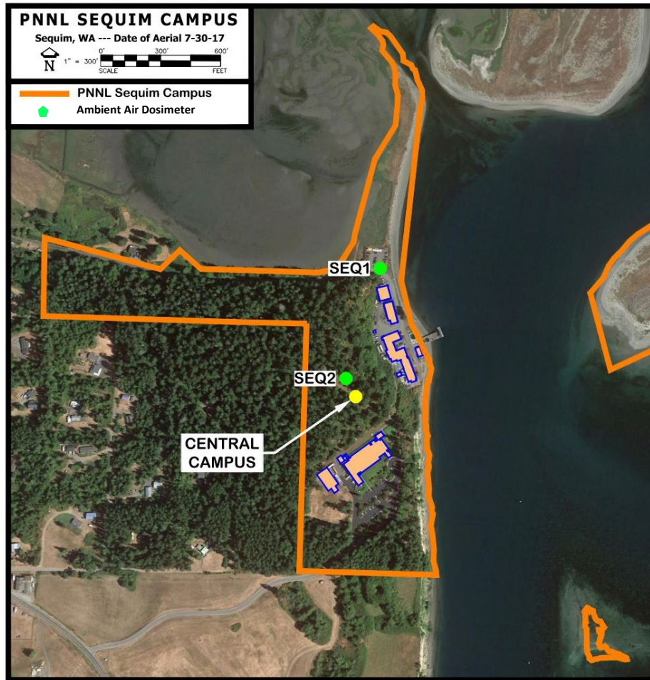
Figure 2.1. PNNL Sequim Campus with Central Campus Location Identified