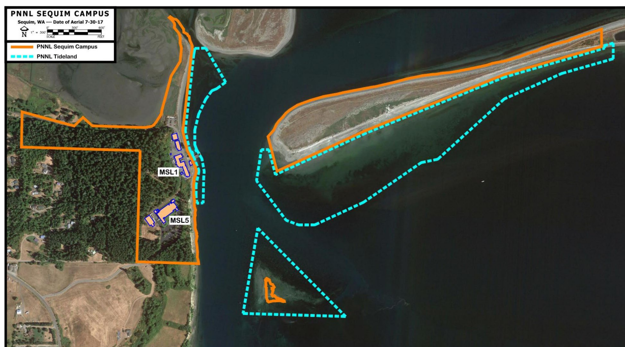
Figure 1.2. PNNL Sequim Campus including Tidelands

The PNNL Sequim Campus is shown in Figure 1.2. The boundary is consistent with the Master Plan for DOE operations at the PNNL Sequim Campus (PNSO 2020). The entire PNNL Sequim Campus as presented in this report encompasses 129 acres of dry lands (65 ac) and tidelands (64 ac), of which about 7.5 acres have been developed for research operations.