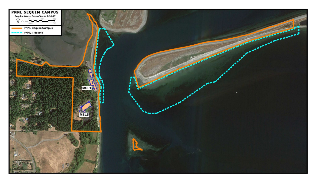
Figure 1.2. PNNL Sequim Campus including Tidelands

The PNNL Sequim Campus is shown in Figure 1.2 and Figure 1.3. The boundary is consistent with the Master Plan for DOE operations at the PNNL Sequim Campus (PNSO 2020). The entire PNNL Sequim Campus as presented in this report encompasses 117 acres of dry lands (65 ac) and tidelands (52 ac), of which about 7.5 acres has been developed for research operations.