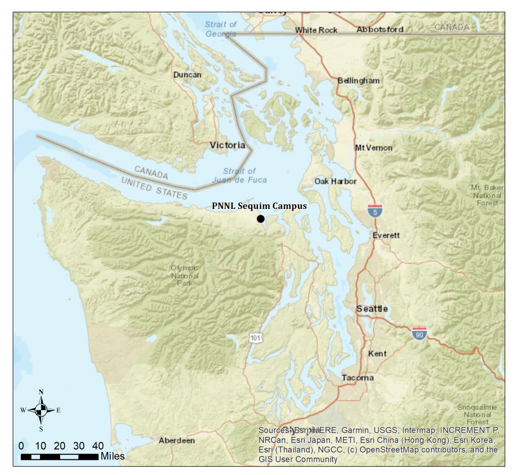
Figure 1.1. PNNL Sequim Campus in Northwestern Washington State

This radiological air emissions report meets the Washington Department of Health (WDOH) requirements for radiological National Emission Standards for Hazardous Air Pollutants (NESHAP) compliance reporting for the activities at the PNNL Sequim Campus for calendar year (CY) 2021. Site air effluent emissions are governed under WDOH Radioactive Air Emissions License (RAEL)-014, Renewal 1. Compared to the prior year, radiological laboratory activities have not substantially changed. Sequim Campus on-site activities were reduced in March 2020 due to the COVID-19 pandemic. Reduced activities were maintained through 2021. This pandemic response did not impact the considerations or calculations for this compliance report, largely as a consequence of the low level of radiological operations at the site.