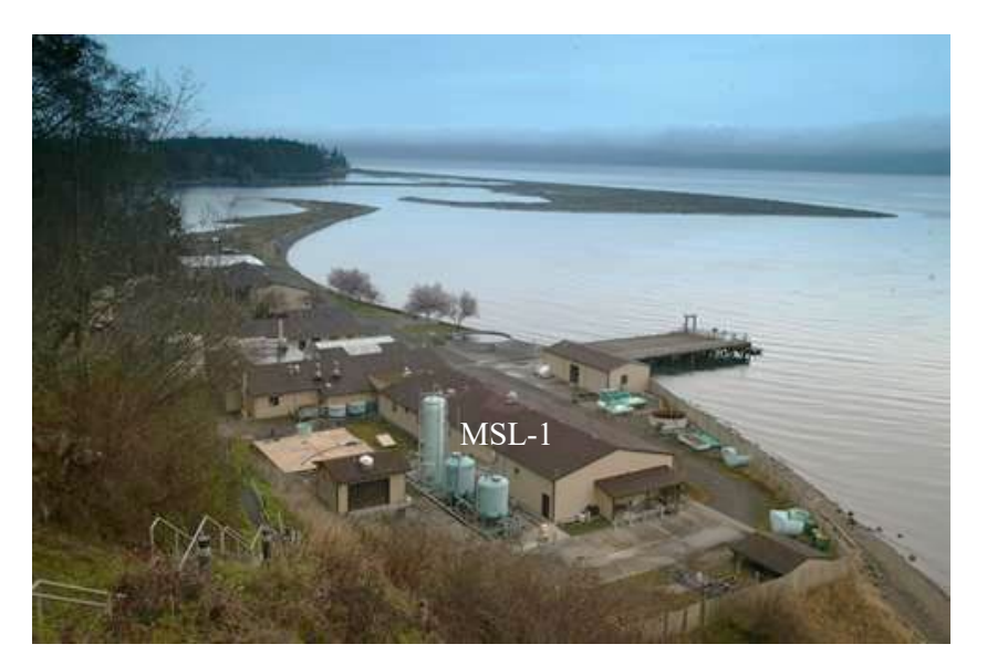
Figure 1.4. MSL-1 Building