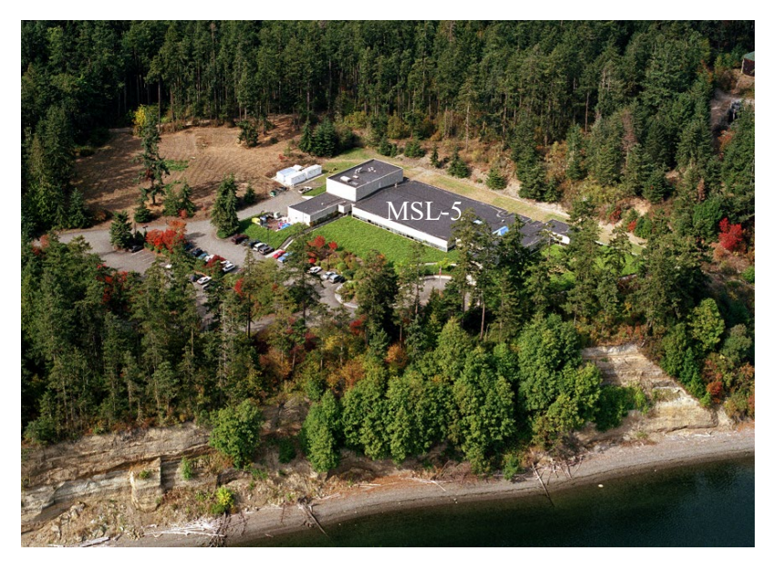
Figure 1.5. MSL-5 Building