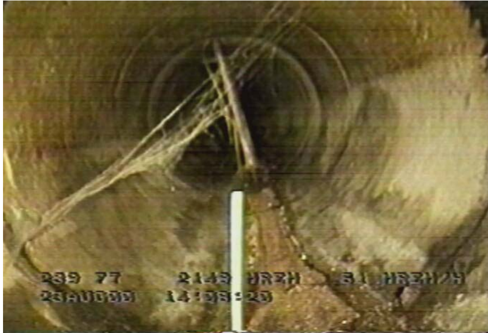
Figure 5. Drain Line Robot Inspection Pipe Obstruction