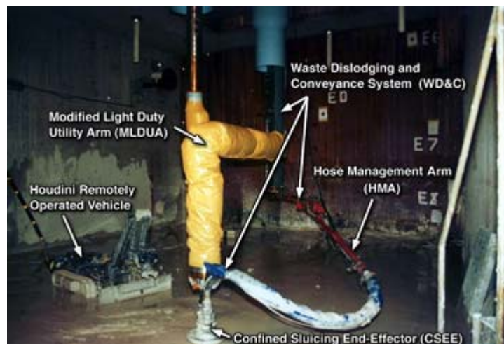
Figure 2. Main Components of the GAAT In-tank Equipment