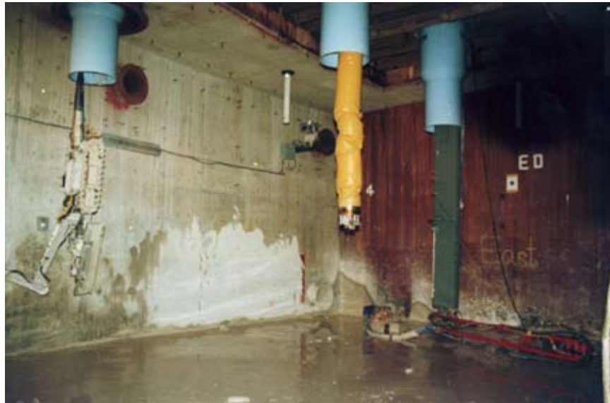
Figure 3. GAAT In-tank Equipment Deployed via Three Risers in Cold Test Facility