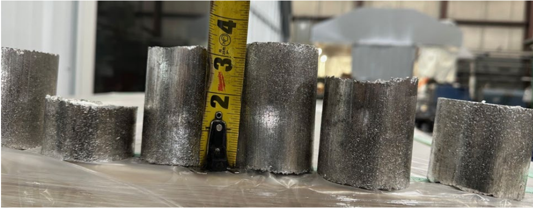
Figure 1. Briquettes cold compacted from dry-machined magnesium alloy chips.

Briquettes had a diameter of 2.44" and length ranging from 2.5" to 3.0" as shown in Figure 1. Archimedes measurements revealed the billet had a density >90% of bulk density. For extrusion diameters of 0.25" and 0.50", the extrusion ratios (ER) were 95 and 24 respectively. Briquettes were stacked to 4-5" total height and processed by ShAPE over a range of temperatures (450-550°C) and ram speeds (10-40 mm/min). The length of 0.25" diameter rods was nominally 30 feet while the length of 0.50" diameter rods was nominally 8 feet.