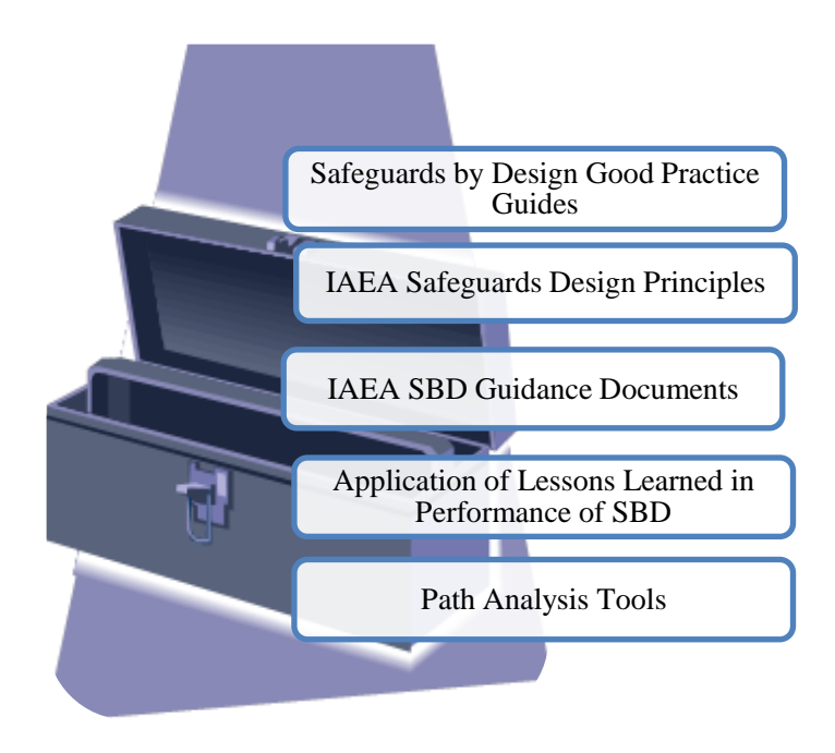
Figure 3 FSA Toolbox Elements

This section introduces these tools and briefly addresses the way a designer could find them of use.