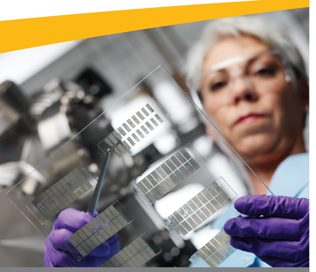
Thin films—or microscopic layers of material with unique, useful properties—offer enormous potential for energy applications. PNNL research in this discipline is yielding innovative approaches in areas that include solid-state lighting and displays, batteries, and photovoltaics.