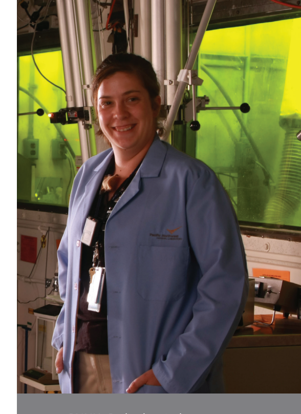
PNNL's Radiochemical Processing Laboratory is a Hazard Category 2 non-reactor nuclear lab that facilitates work with highly radioactive materials. Researchers in the RPL are advancing solutions in radioactive and hazardous waste cleanup, nuclear fuel processing and disposal, and medical isotope production.

PNNL's energy and environment experts serve as resources to policymakers, lead national forums, and participate in prestigious professional societies and academies. We understand the importance of research collaborations, and we frequently partner with other national laboratories, industry, and universities. We recently reached landmark agreements with China to work together in energy, science, and security.